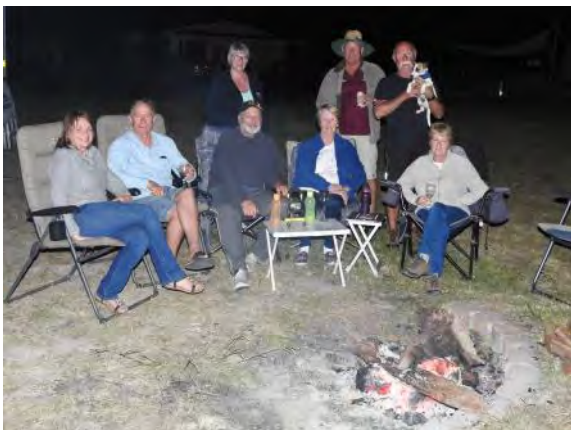
Relaxing by the fire