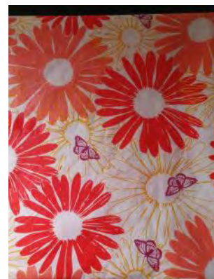
Found 1 tablecloth, if this is yours contact Lyn Ambrose